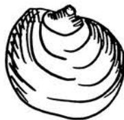
Clam or Mussel