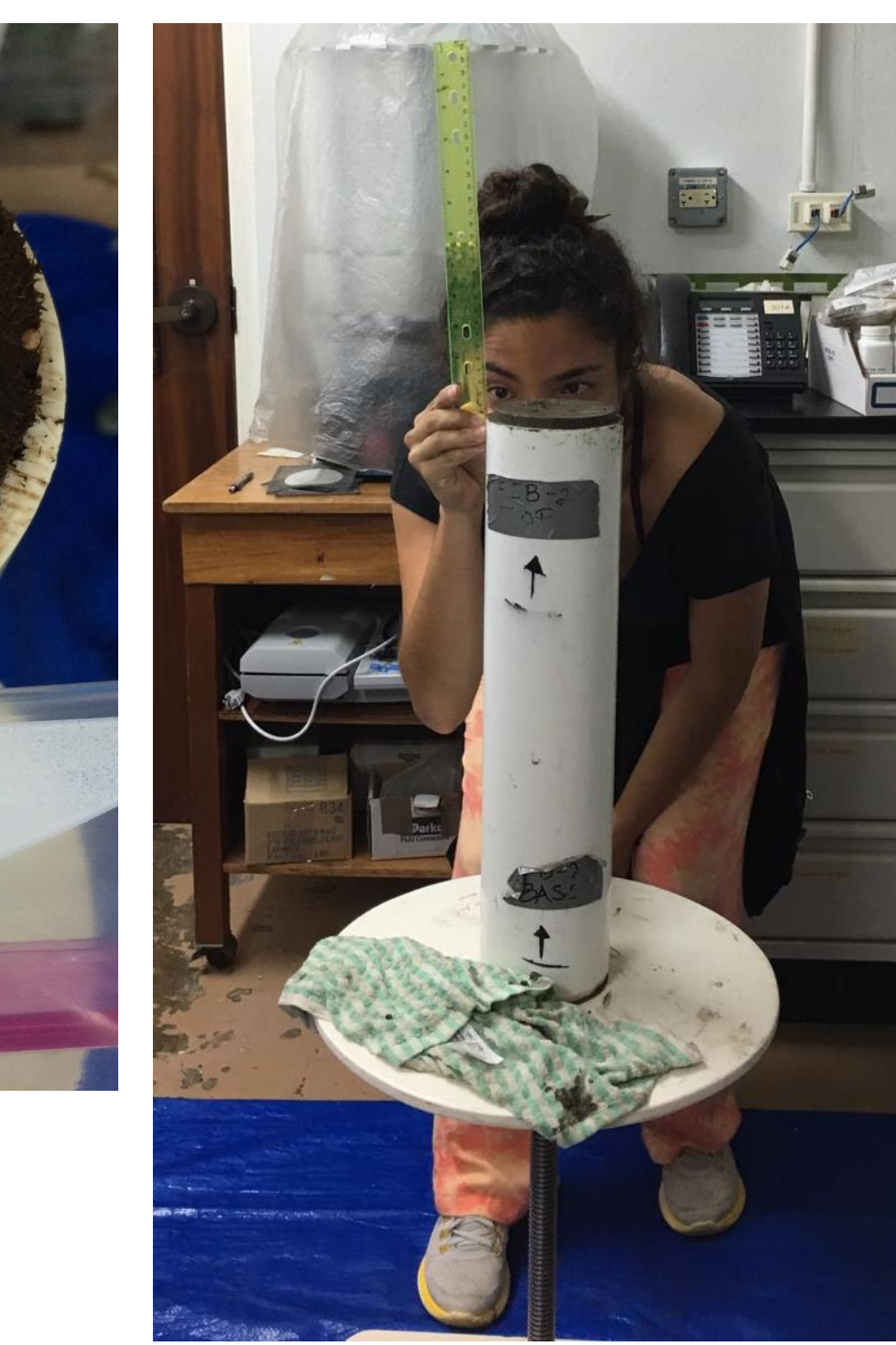
Figure 2. Core sampling in La Parguera mangroves, top view of sediment sample and horizontal core sectioning.