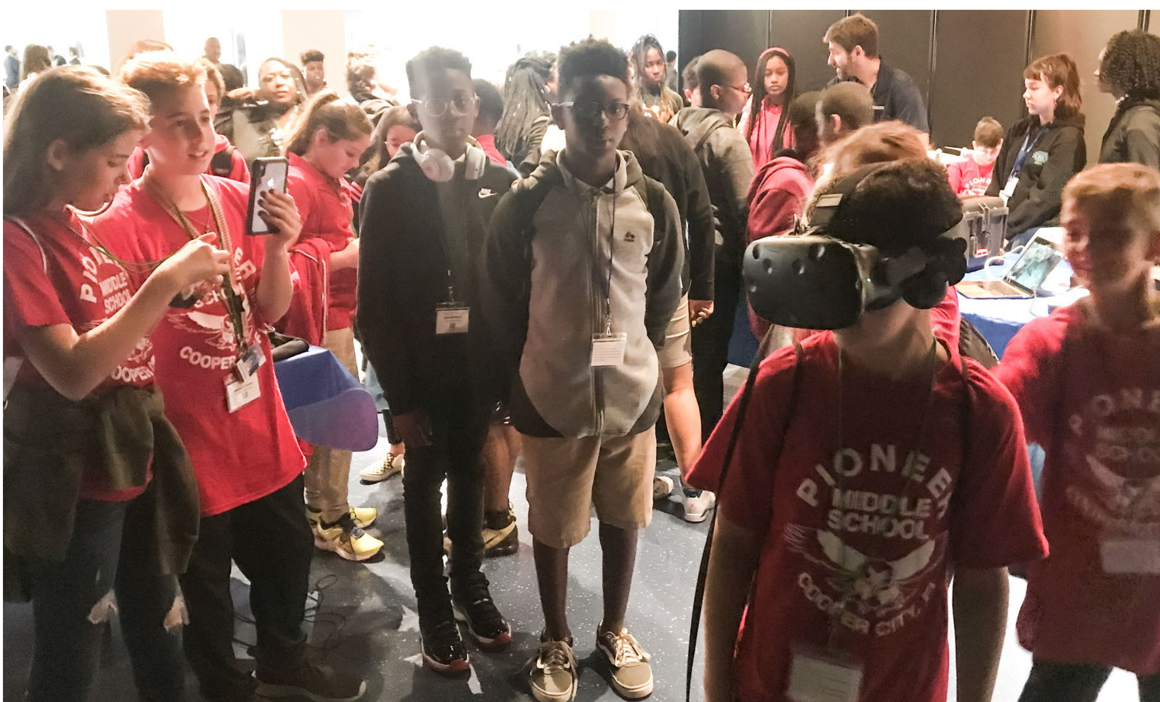
Figure 2. Broward Youth Climate Summit