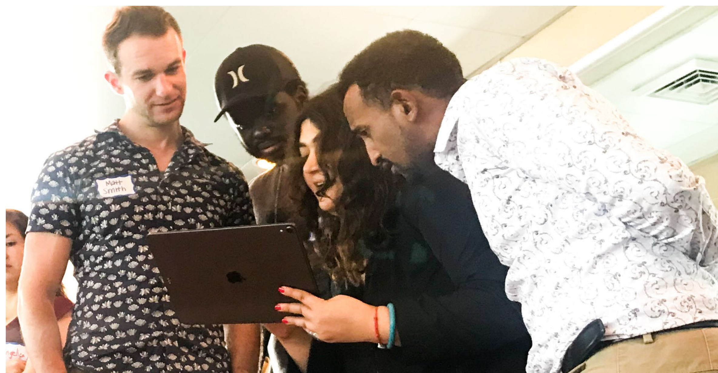
Figure 1. CREST Miami River Tour