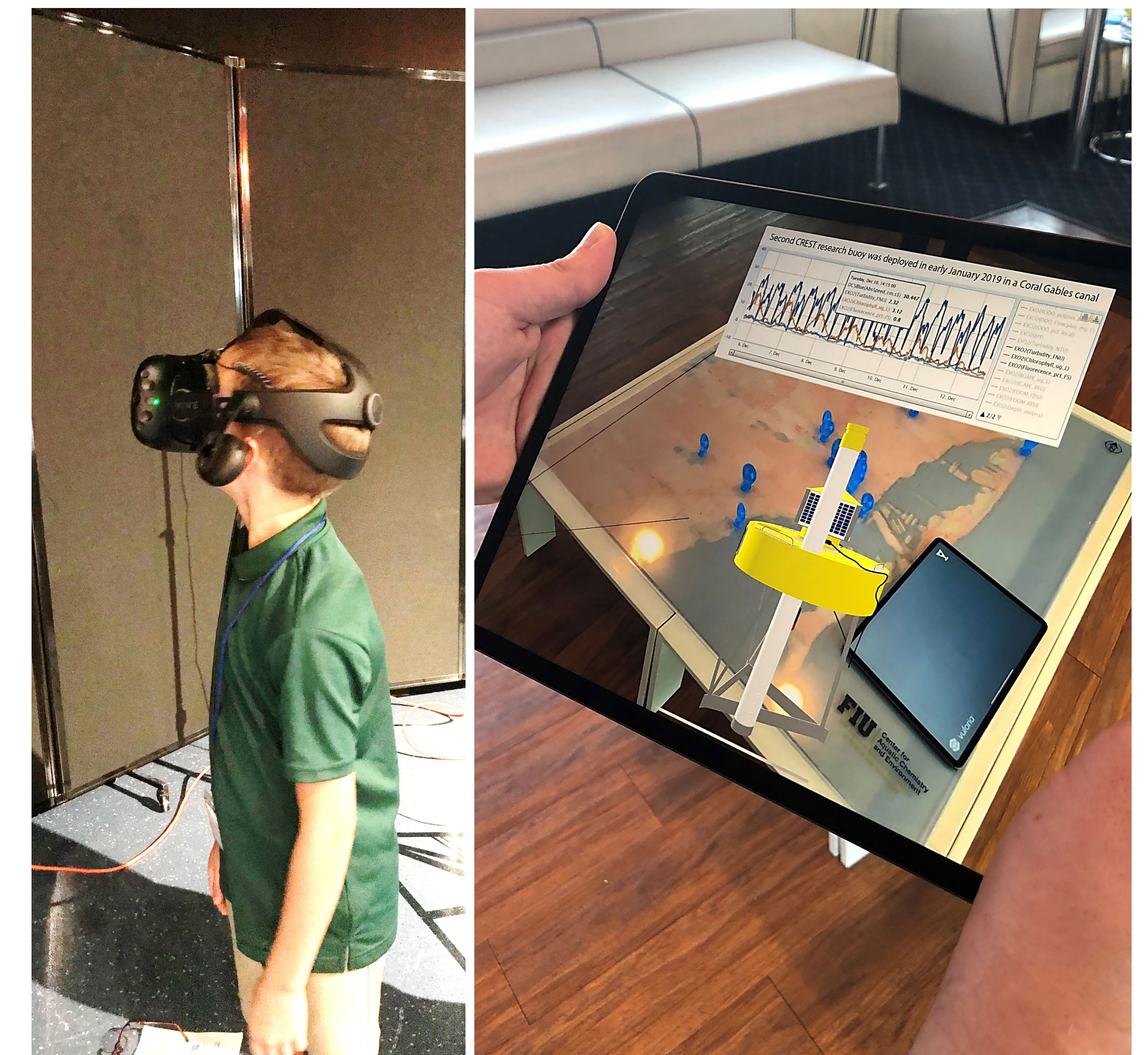
Figures 4 and 5. AR and VR demonstrations to the public at Broward Youth Climate Summit